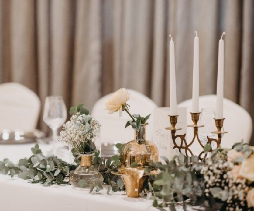
Table decoration for newlyweds

In cooperation with you, we will adjust the maximum design and selection of flowers to your personality and style defined conditions, which will make your wedding day special.